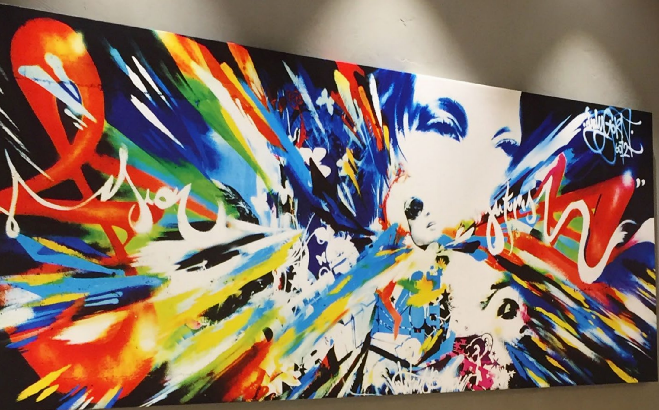
Keith Haring, "Rhythm" (1982). Oil on canvas, 100 x 100 cm. Collection of the artist, New York, NY.